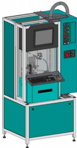
Figure 1 Prototype CRi-PC Test Stand